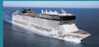
NORWEGIAN EPIC - LAUNCHED 7/10