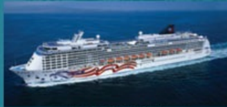
PRIDE OF AMERICA