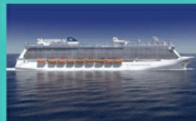
BREAKAWAY PLUS – SHIP 1 OCTOBER 2015