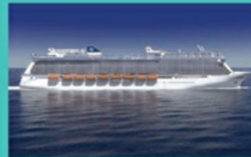
BREAKAWAY PLUS – SHIP 1 OCTOBER 2015