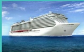
NORWEGIAN GETAWAY JANUARY 2014