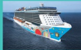
NORWEGIAN BREAKAWAY – MAY 2013