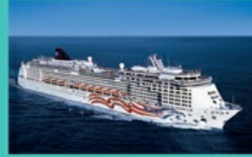
PRIDE OF AMERICA