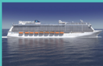
BREAKAWAY PLUS – SHIP 1 OCTOBER 2015