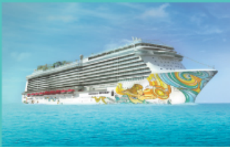
NORWEGIAN GETAWAY JANUARY 2014