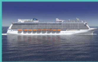
BREAKAWAY PLUS – SHIP 1 OCTOBER 2015