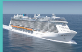
BREAKAWAY PLUS – SHIP 2 SPRING 2017