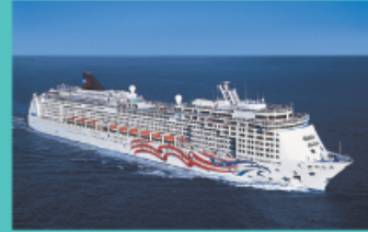
PRIDE OF AMERICA