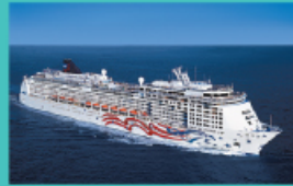
PRIDE OF AMERICA