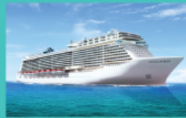
NORWEGIAN BLISS SPRING 2017