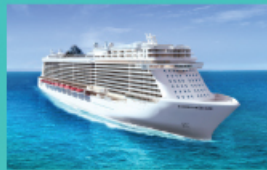
NORWEGIAN ESCAPE OCTOBER 2015