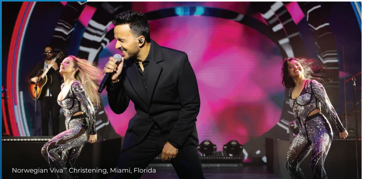
Norwegian Viva™ Christening, Miami, Florida