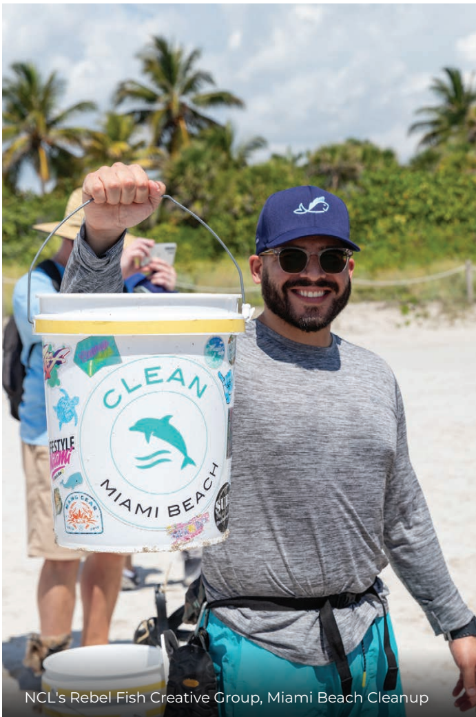
NCL's Rebel Fish Creative Group, Miami Beach Cleanup