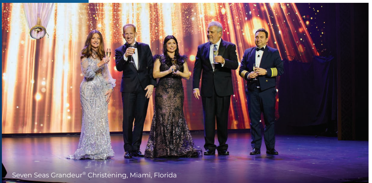
Seven Seas Grandeur® Christening, Miami, Florida