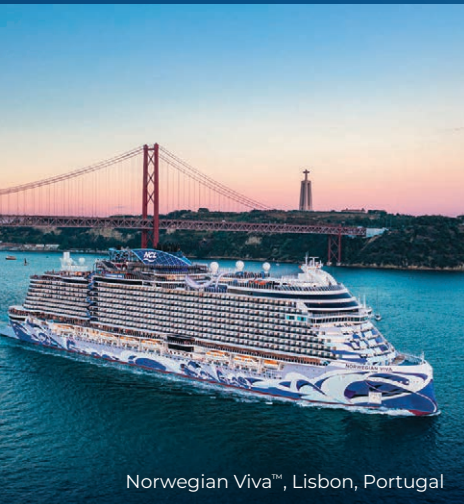
Norwegian Viva™, Lisbon, Portugal

Norwegian Cruise Line Holdings Ltd. (NYSE: NCLH) is a leading global cruise company which operates the Norwegian Cruise Line, Oceania Cruises and Regent Seven Seas Cruises brands. With a combined fleet of 32 ships and approximately 66,500 berths, these brands offer itineraries to more than 700 destinations worldwide. The Company expects to add 13 additional ships across its three brands through 2036, which will add approximately 41,000 berths to its fleet.