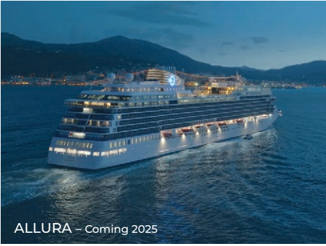
ALLURA – Coming 2025