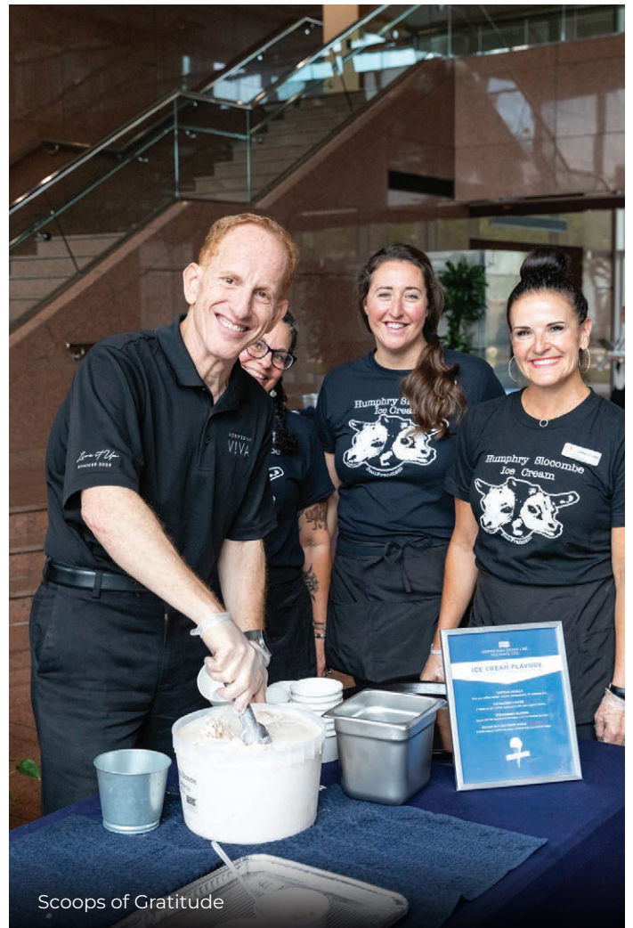
Scoops of Gratitude