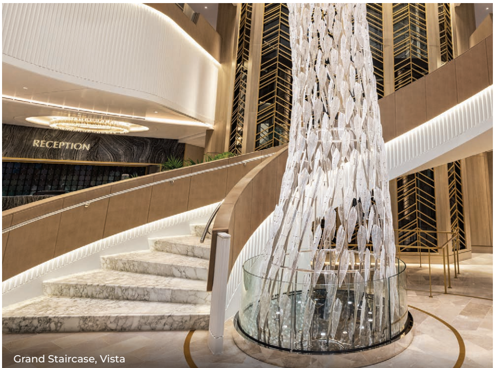
Grand Staircase, Vista