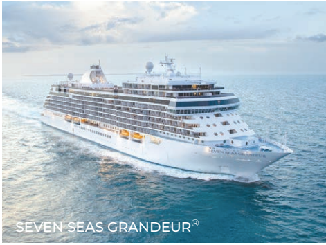
SEVEN SEAS GRANDEUR®