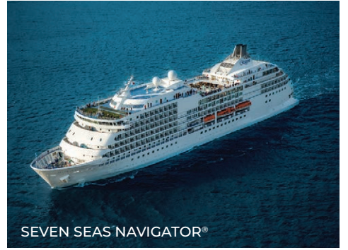
SEVEN SEAS NAVIGATOR®