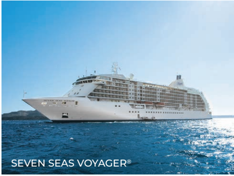
SEVEN SEAS VOYAGER®