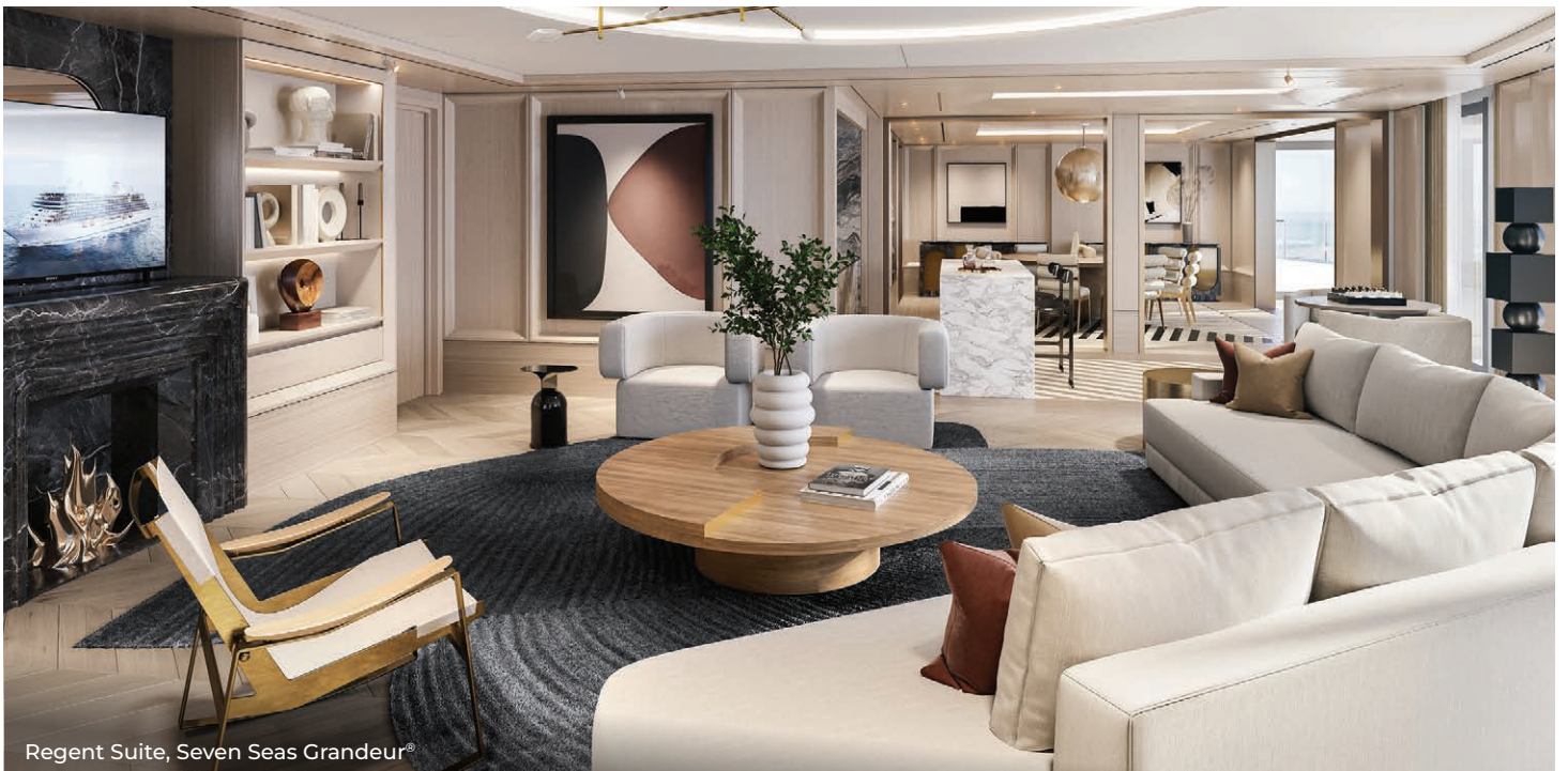
Regent Suite, Seven Seas Grandeur®