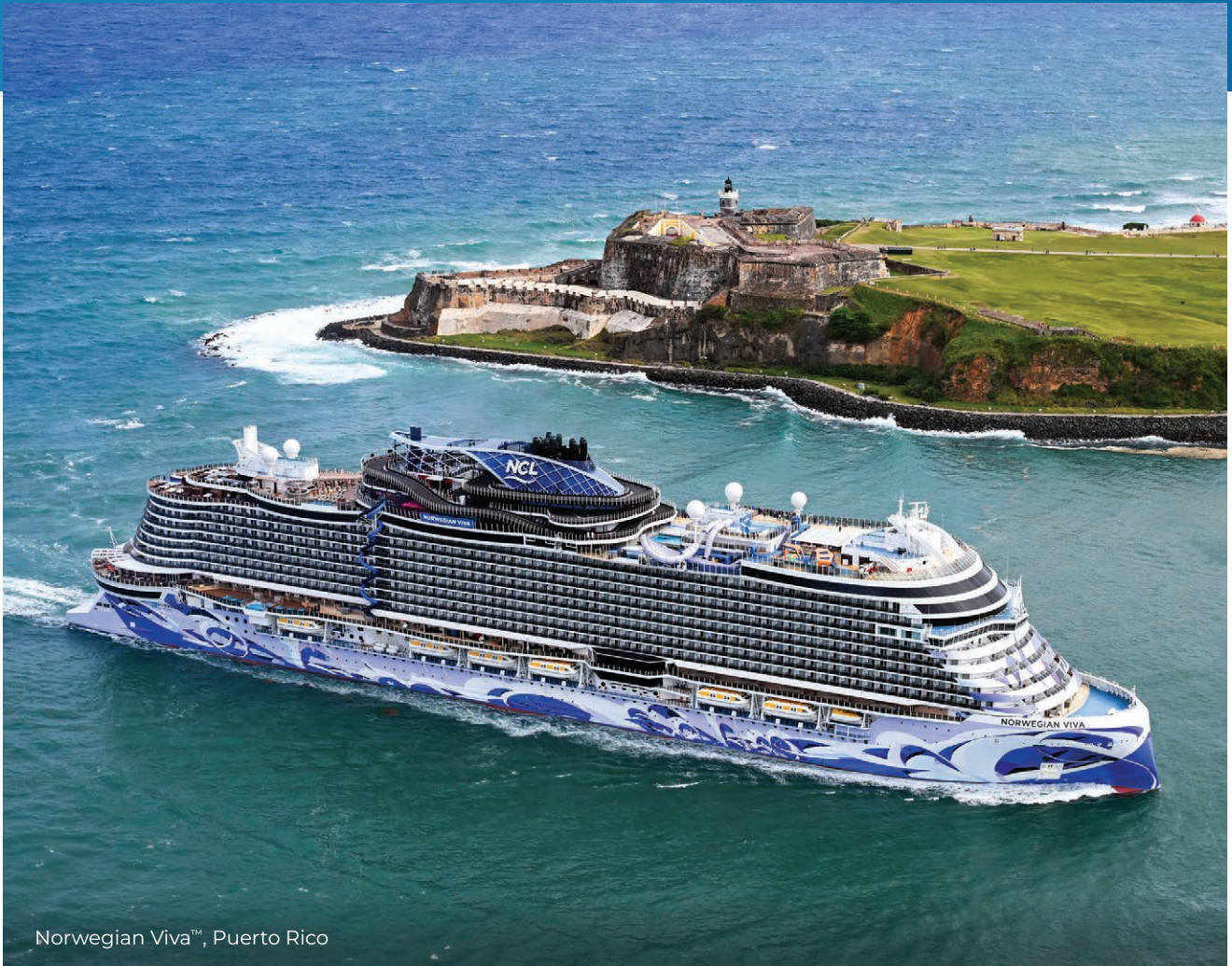
Norwegian Viva™, Puerto Rico