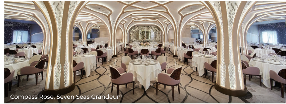
Compass Rose, Seven Seas Grandeur®