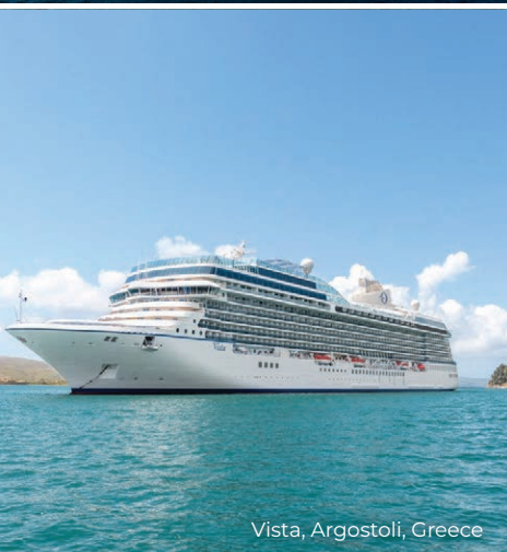
Vista, Argostoli, Greece

As the innovator in global cruise travel, Norwegian Cruise Line® has been breaking the boundaries of traditional cruising for over 57 years. Most notably, the cruise line revolutionized the industry by offering guests the freedom and flexibility to design their ideal vacation on their preferred schedule with no assigned dining and entertainment times and no formal dress codes. Today, its fleet of 19 contemporary ships sails to over 400 of the world's most desirable destinations, including Great Stirrup Cay, the Company's private island in the Bahamas, and its resort destination Harvest Caye in Belize.