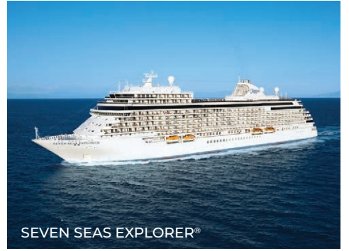
SEVEN SEAS EXPLORER®