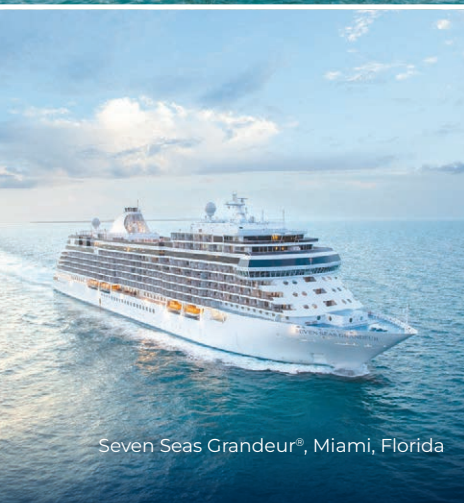
Seven Seas Grandeur®, Miami, Florida

Oceania Cruises is the world's leading culinary- and destination-focused cruise line. The line's eight small, luxurious ships carry a maximum of 1,250 guests and feature The Finest Cuisine at Sea® and destination-rich itineraries that span the globe. With expertly curated travel experiences aboard, the designer-inspired, small ships call on more than 600 marquee and boutique ports in more than 100 countries on seven continents on voyages that range from seven to more than 200 days. The brand has a second 1,200-guest Allura Class ship on order for delivery in 2025.