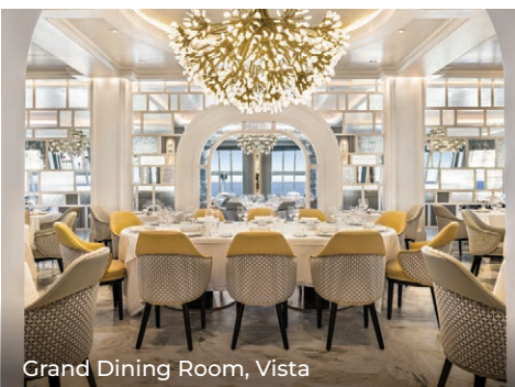
Grand Dining Room, Vista