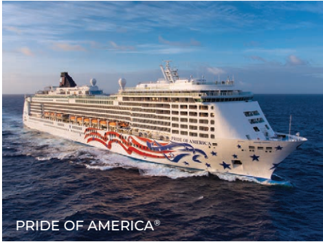
PRIDE OF AMERICA®