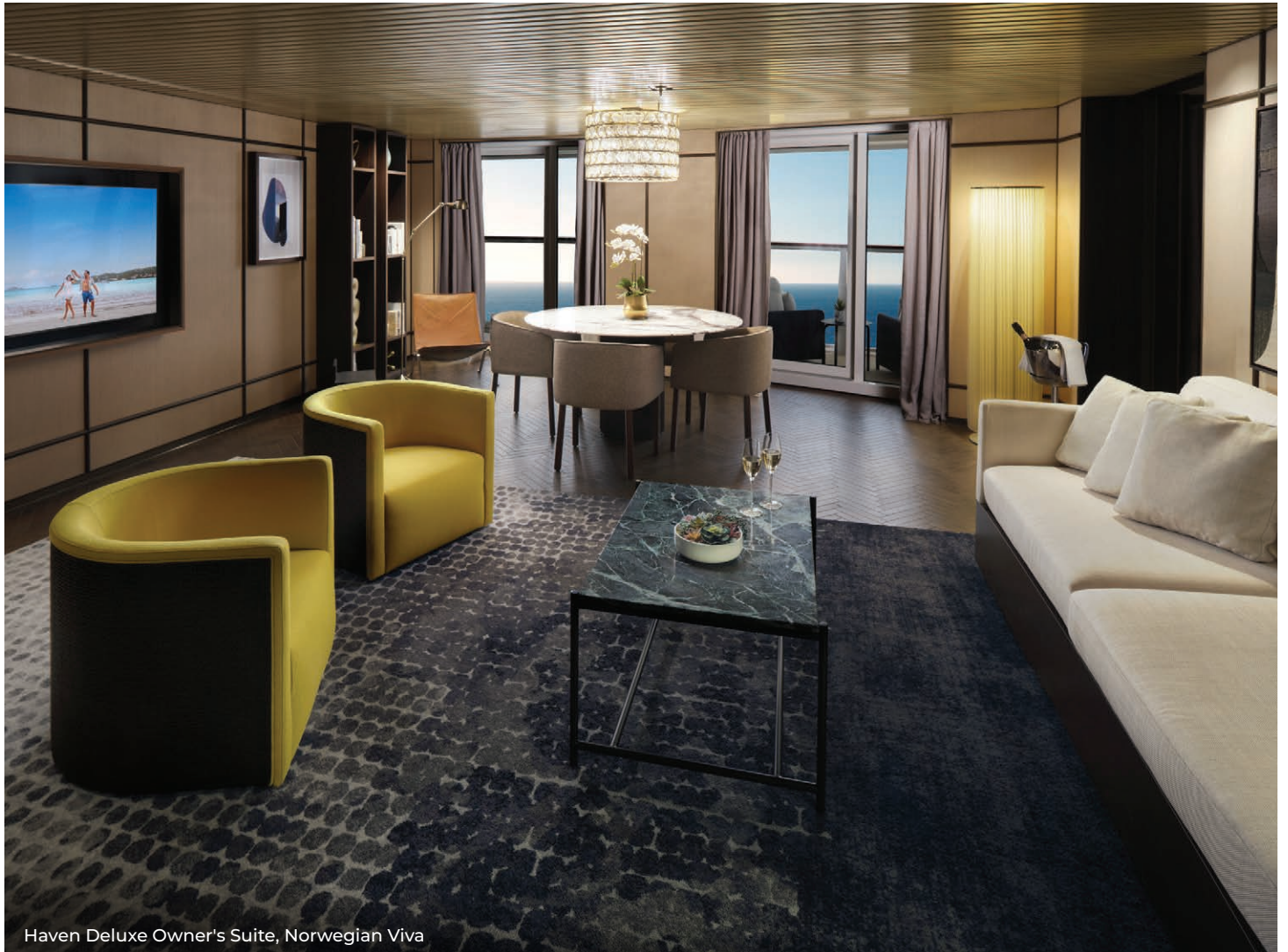
Haven Deluxe Owner's Suite, Norwegian Viva