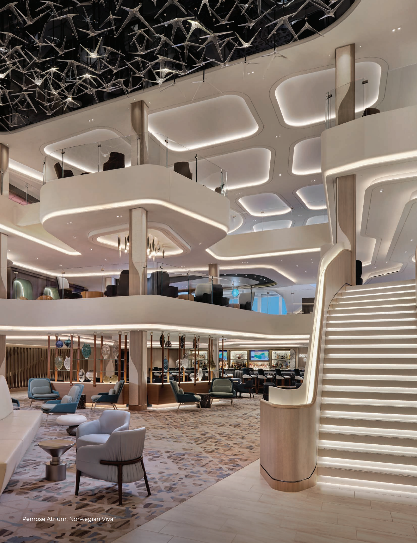
Penrose Atrium, Norwegian Viva™