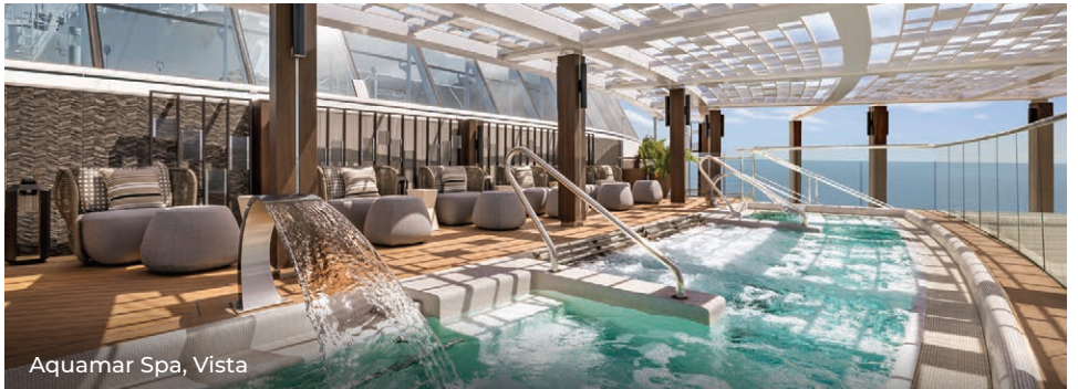
Aquamar Spa, Vista