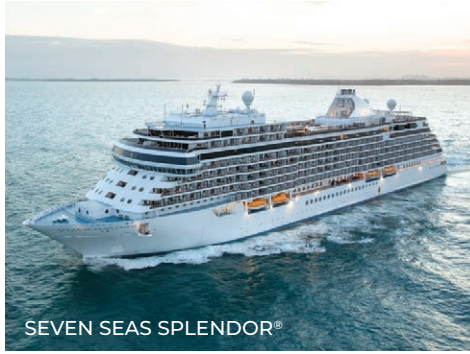
SEVEN SEAS SPLENDOR®