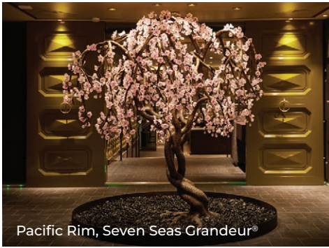
Pacific Rim, Seven Seas Grandeur®